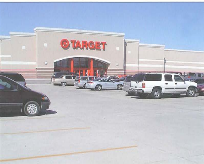
Concrete parking delivers curb appeal: Bright, white concrete enhances any property. Plus, increased reflectivity can lower cooling and lighting costs.

Concrete parking areas pay for themselves in the short term, then deliver long-term savings. Compared to asphalt: