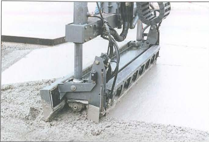
Concrete parking delivers speed and lower installed cost: Concrete pavement technology is continually improving. Laser screeds speed up placement time, improve accuracy and reduce labor costs.

Concrete paving technology continues to advance, making concrete construction quicker and more of a value than ever. Innovations such as slipform paving machines offer the highest production rates of any construction method and yield uniform, durable surfaces. Advanced finishing methods like laser screeding combine precision and speed to lower installed costs and produce the highest quality results.